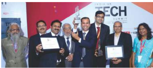
Grand Award (Most Innovative Company of the year) & Award for Manufacturing Sector Large Enterprise JCB India