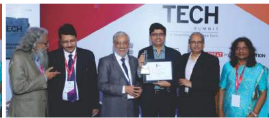
Award for Manufacturing Sector Micro & Small Enterprise Vyome Biosciences Pvt. Ltd.