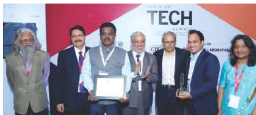
Award for Service Sector Medium Enterprise Cholan Tours Pvt. Ltd.