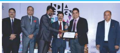
Best Service Start-up iTeach Fellowship (An initiative of iTeam Advisors Echelon Pvt. Ltd.)