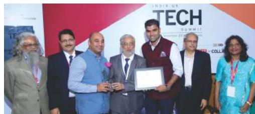
Award for Service Sector Micro & Small Enterprise Rajasthan Fort and Palace Pvt. Ltd.