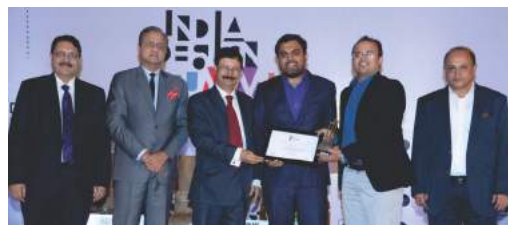
Best Manufacturing Start-up Embryyo Technologies Pvt. Ltd.