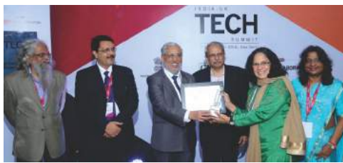
Award for Manufacturing Sector Medium Enterprise Grind Master Machines Pvt. Ltd.