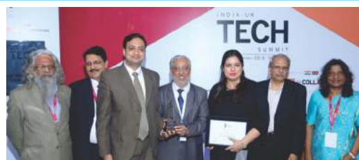
Award for Service Sector Large Enterprise Tata Power Delhi Distribution Ltd.