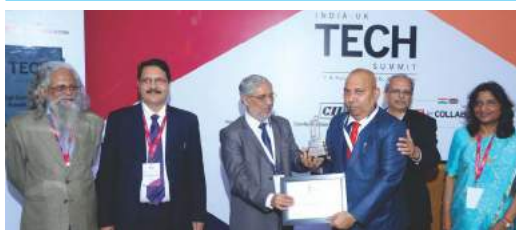
Award for Manufacturing Sector Micro & Small Enterprise Lotus Wireless Technologies India Pvt. Ltd.