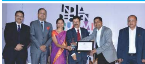
Best Manufacturing Start-up Creintors Teknosol Pvt. Ltd.