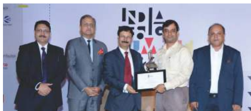
Grand Award (Most Promising Start-up) Multiversal Technologies