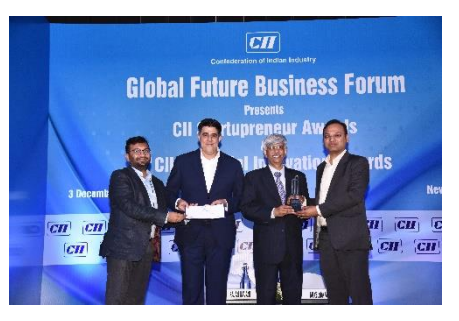
Award for Service sector (Micro & small enterprises) (Joint Winners) TruckHall Pvt. Ltd.