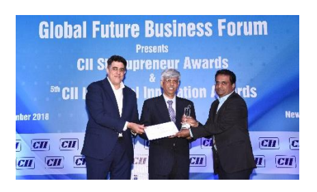
Award for Manufacturing sector (Micro & small enterprises) Stellapps Technologies Pvt. Ltd.