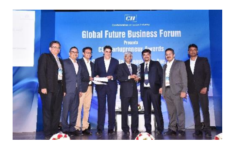
Grand Award Winner & Award for Manufacturing sector (Large enterprises) Mahindra & Mahindra Ltd.