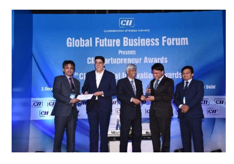
Award for Service sector (Micro & small enterprises) (Joint Winners) Kale Logistics Solutions

Award for Service sector (Large enterprises) Indus Towers